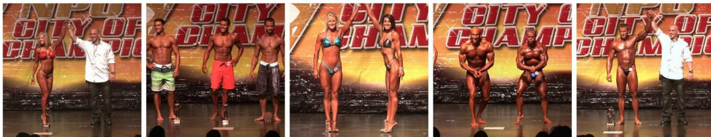
Highlights from the 2013 NPC City of Champions