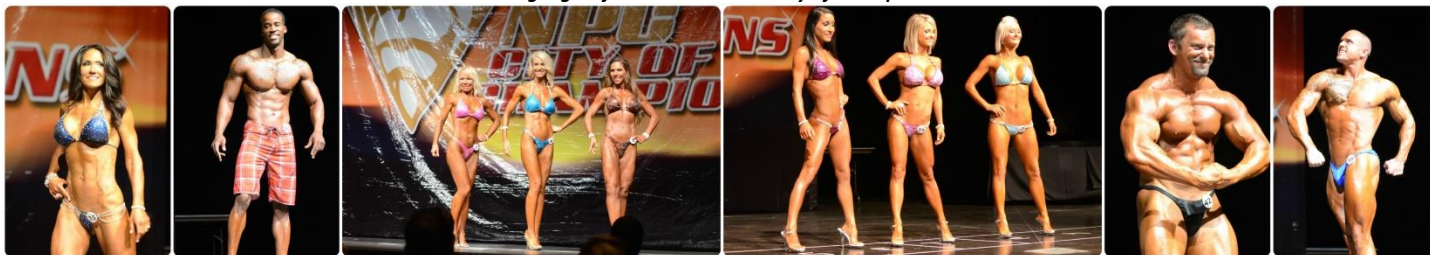
Highlights from the 2014 NPC City of Champions